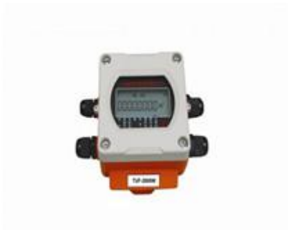
LCD for water meter