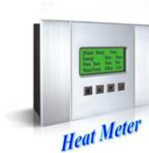
lcd for heat meter